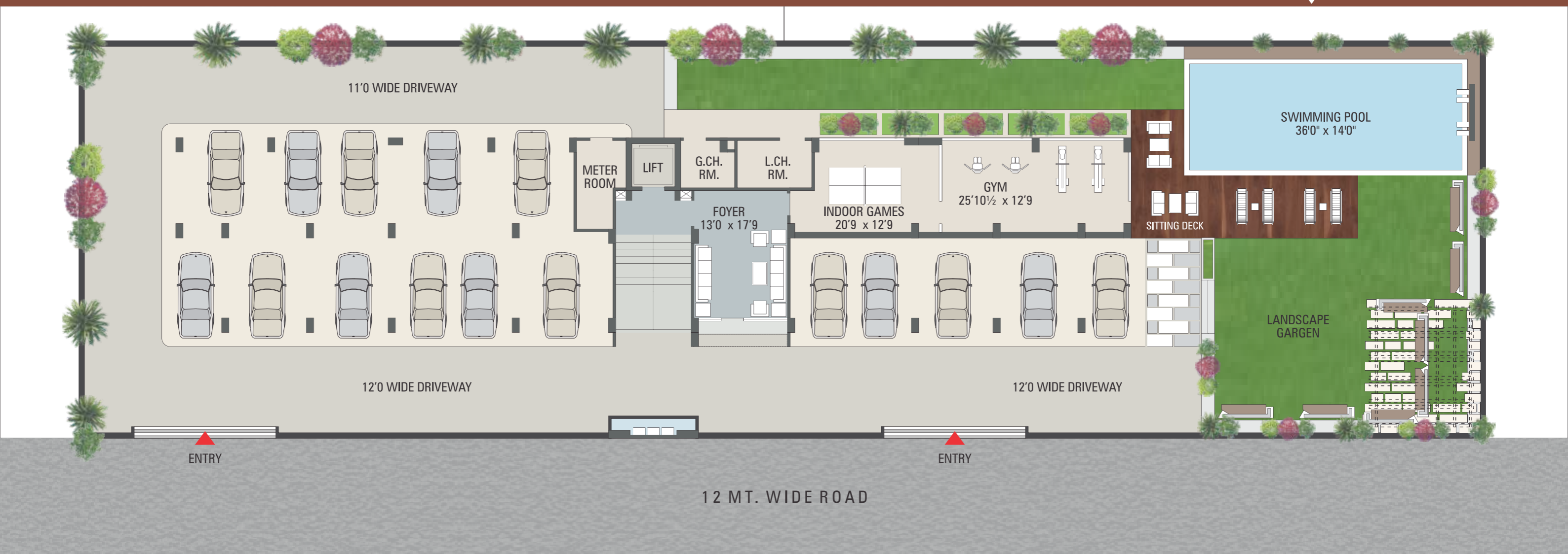
▼ GROUND FLOOR PLAN