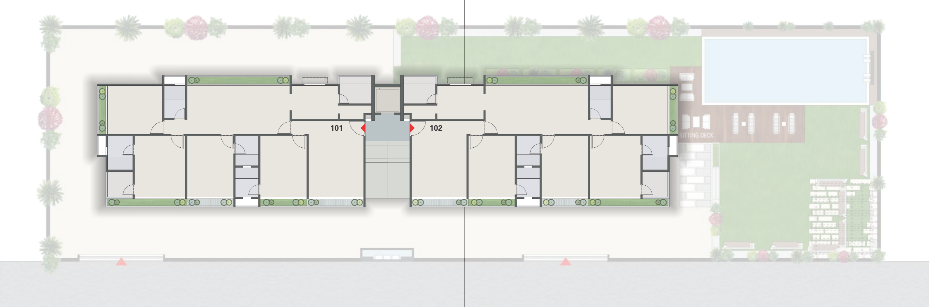
TYPICAL LAYOUT PLAN ▲